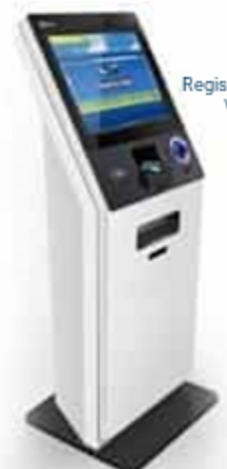
Registration & Printing Visitor Pass